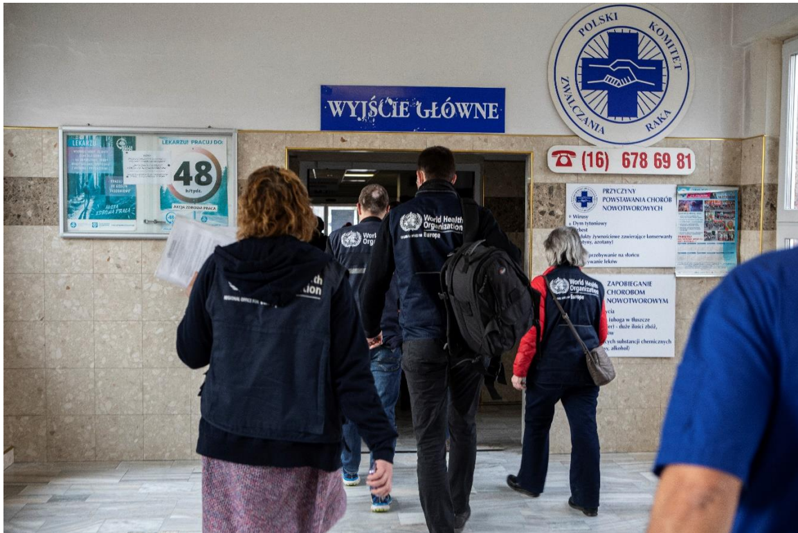
The largest hospital in the Polish border town of Przemyśl tackled SARS-CoV-2 for two years.